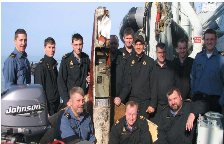
HMCS REGINA NESOP Section